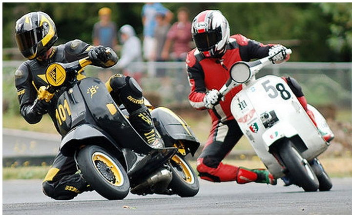
Our own Drat (#58) on the prowl at Pat's Acres.