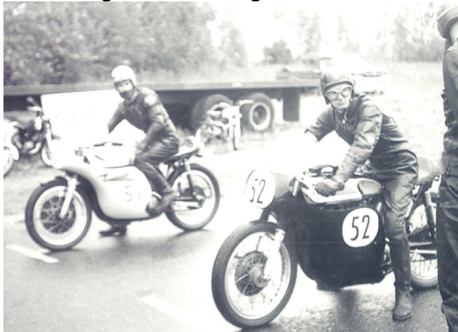
The inscription on this photo from the OMRRA archives says August 1963. This is Cottonwood Ave, the original front straight.