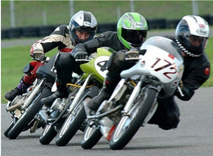
Three in a Row...